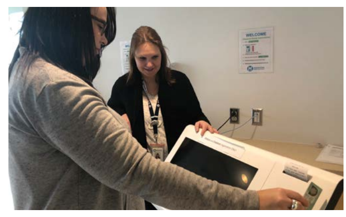
Self-service registration kiosks

Hospitalists at Headwaters are family physicians who provide general medical care to adult patients admitted to D and F-Wings. We created a team of 13 dedicated physicians as part of this program. They rotate through a shift of seven days and seven nights, supporting up to 22 patients at a time. This provides patients, families and the entire care team with the consistency of physician support.